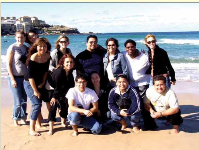
Fullerton University Singers at Manly Beach

The gateway to Australia, Sydney is renowned as a dynamic and cosmopolitan city, combining excellent business and educational facilities with a great leisure lifestyle. Australia's oldest and largest city is set on one of the world's most stunning harbors, fringed by easy-to-reach, sandy beaches. Sydney Harbour separates the city into north and south, with harborside villages, beachside suburbs and inner city areas full of life and their own distinctive character. Brilliant performance venues include Verbrugghen Hall, St. Andrew's Cathedral and St. Luke's Anglican Church. There are also numerous opportunities for joint concerts and exchanges with local choirs.