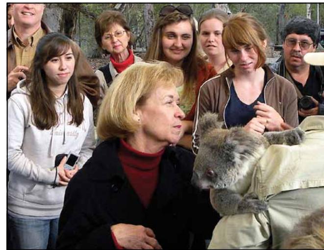
Fresno Pacific University Concert Choir at Walkabout Wildlife Sanctuary near Sydney, Australia