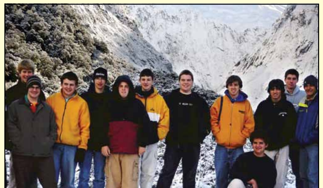
Kantorei, The Singing Boys of Rockford, in Milford Sound