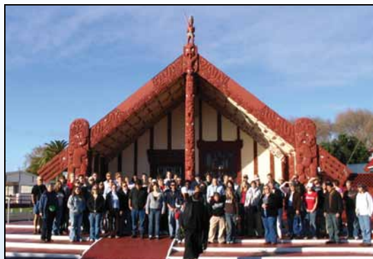
Northern Arizona University Shrine of the Ages Choir and the Master Chorale of Flagstaff at the Ohinemutu Marae, Rotorua, New Zealand

Stepping back into the 1930's when walking through the streets of Napier, New Zealand's beautifully preserved 'retro' city