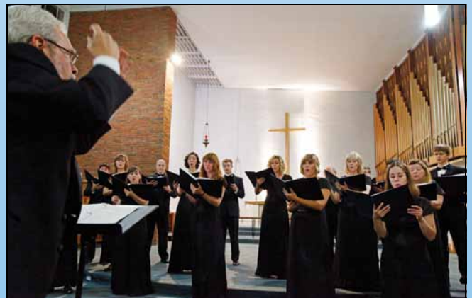
Fresno Pacific University Concert Choir performs at St. Peter's Anglican Church in Takapuna