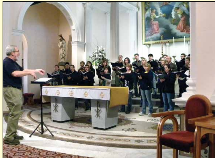
Fresno Pacific University Concert Choir rehearses in Sacred Heart Cathedral in Wellington for its joint concert with the Seraphim Choir of Chilton Saint James School

Mother Nature created the New Zealand wonderland. Formed by intense volcanic action, New Zealand's landscape is nothing short of breathtaking. Begin your tour in Auckland and wend your musical way south through the geothermal region of Rotorua, the limestone caves of Waitomo, Karangahake Gorge, and the wine region of Hawke Bay. Hop across to the South Island and explore the Fox and Franz Josef Glaciers, Fiordland National Park, the stunning World Heritage Site of Milford Sound, and the beautiful cities of Christchurch, Queenstown and Dunedin, while performing for amazingly friendly New Zealanders along the way.