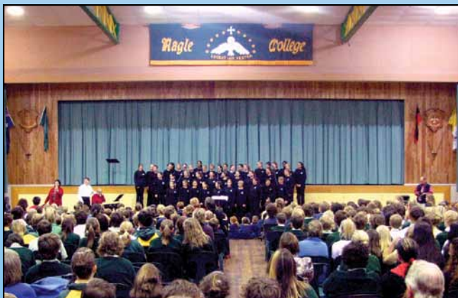
St. Louis Children's Choir performs for students of Nagle College and St. Mary's Primary School in Bairnsdale

Closer to Brisbane, Sydney and Melbourne are plenty of hospitable country towns such as Buderim and Surfers Paradise, Port Macquarie and Wagga Wagga, Bendigo and Ballarat, and our Australian Manager's hometown of Bairnsdale.