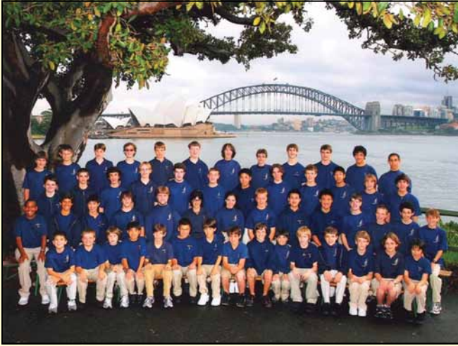
Ragazzi Boys Chorus at Mrs. Macquaries Point by Sydney Harbour

For over 55 years, ACFEA has been arranging concert tours to the best known and most prestigious cultural centers in Europe, and our enthusiasm for these destinations has never waned. However, in recent years our network of offices and representatives has expanded greatly, and we can now offer you the ACFEA experience in many less traditional places on every continent. Now is the time to consider Australia or New Zealand as your next destination.