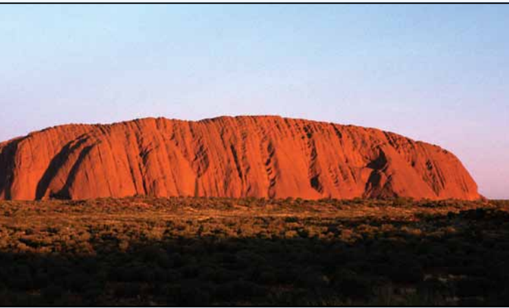
Uluru, also known as Ayers Rock, can be seen for miles standing above the Australian desert landscape