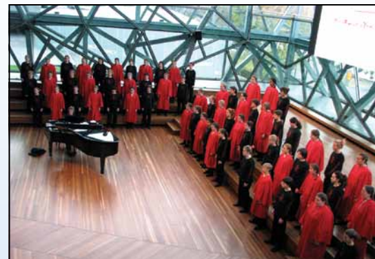
St. Louis Children's Choir performs a joint concert with the Young Voices of Melbourne at the BMW Edge Theatre in Melbourne