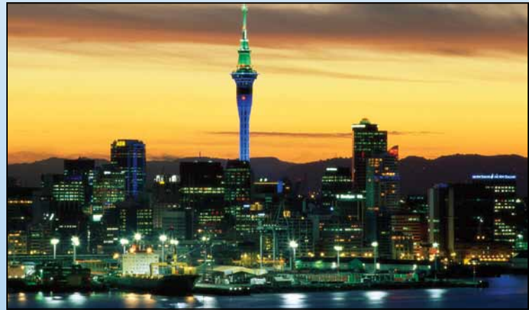
Auckland skyline at night

Auckland's waterside location has fostered the locals' love affair with the sea, earning it the nickname 'City of Sails'. Auckland sprawls over a narrow isthmus between the sparkling waters of the Waitemata and Manukau Harbours. Rainforests cover the surrounding hills, dozens of dormant volcanic cones dot the landscape and enchanting holiday islands are scattered throughout the vast Hauraki Gulf. In addition to all of the amazing scenery, Auckland is a cosmopolitan city with numerous performance opportunities in intimate venues such as St. Peter's and St. Matthew's Churches.