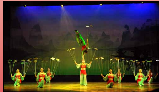
The world-famous Shanghai Acrobats