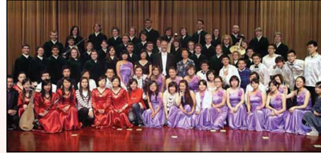
University of Saskatchewan Greystone Singers with Xi'an Jiaotong Technical University choir and orchestra students in the XJTU auditorium in Xi'an