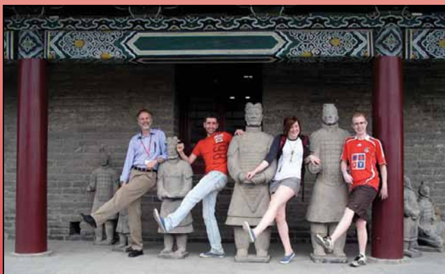
Members of the University of Saskatchewan Greystone Singers having fun at the terra cotta warriors museum in Xi'an