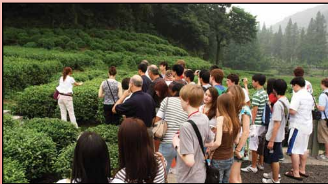
Greater Dallas Youth Orchestra visits a tea village near Hangzhou

The natural beauty of the West Lake, combined with Hangzhou's rich cultural heritage and fine tradition of tea and silk production, have delighted visitors for centuries. Located on the lower reaches of the Qiantang River, the city is the southern terminus of the Grand Canal, and has a subtropical monsoon-type climate, neither too hot in summer nor too cold in winter, making it a great year-round destination.