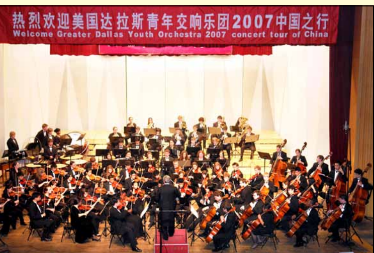
Greater Dallas Youth Orchestra performs in the Central Conservatory in Beijing