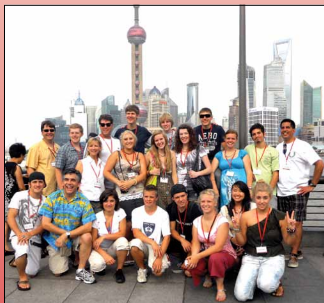
McQueen High School Jazz Choir

Shanghai, once a metaphor for a mystical and inscrutable Far East, evoked images of decadence, spectacular riches, gangster life, and exotic foreign affairs. Today, the city represents China's phenomenal leap towards 21st-century modernization; its numerous sparkling new skyscrapers, bridges and roadways are symbolic of China's emerging economic influence throughout the world.