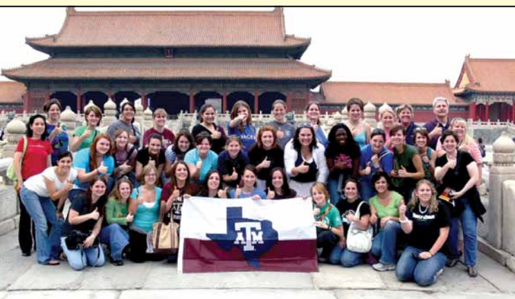
Texas A&M University Women's Chorus in the Forbidden City

Beijing, whose former English name was Peking, is arguably the most historically, culturally and politically stimulating locales in all of mainland China. Its position as the country's capital, its accessibility from abroad and its proximity to the Great Wall make Beijing one of the most visited cities in the world, hosting diplomats, businesspeople and tourists alike.