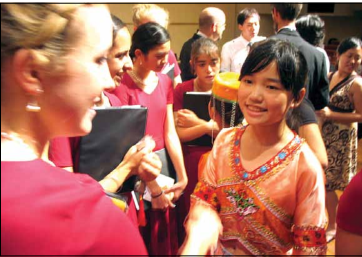
Cornelia Connelly High School Advanced Women's Ensemble with Hangzhou Philharmonic Angel Choir in the Zhejiang Concert Hall