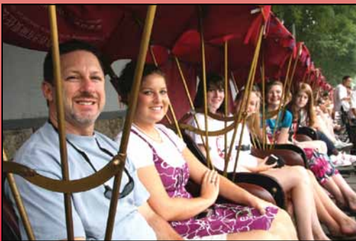
Spartanburg High School Symphony Orchestra students on a rickshaw tour in Beijing