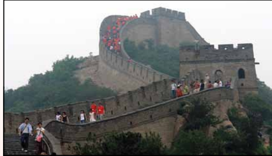
Members of the Greater Dallas Youth Orchestra climb the Great Wall

Visiting Macau and performing in one of its baroque churches