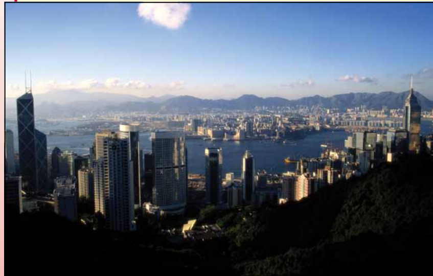
Hong Kong is one of the most vibrant and beautiful cities in the world

Hong Kong, Asia's world city, is a melting pot of world culture, where East meets West. The city of close to seven million people also provides spectacular vistas, to which pictures cannot do justice. Favorite activities include the 360-degree view on the cable car ride to the 'Big Buddha' in Lantau Island, the ever popular Victoria Harbour cruise, walking around Victoria Peak, visiting the Aberdeen fishing village and shopping in Stanley Market. Performance opportunities range from concerts in such venues as the Hong Kong Cultural Centre, City Hall Concert Hall, Academic Community Hall of the Hong Kong Baptist University, St. John's Cathedral and the Baptist University Chapel.