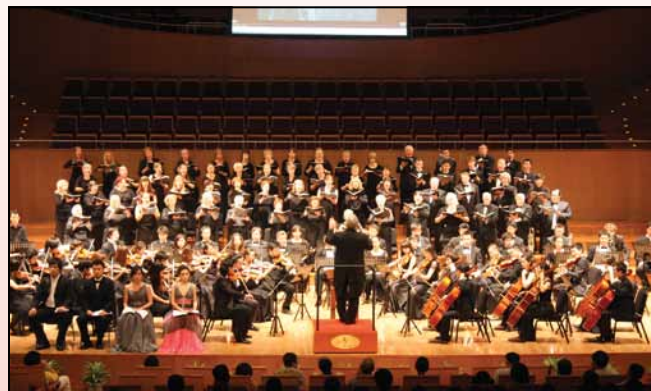
Jonathan Griffith Singers performs The Armed Man in the Shanghai Oriental Art Center