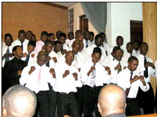
A township choir performs in Khayelitsha near Cape Town

Learning new songs in various African languages taught by an African conductor, then performing them