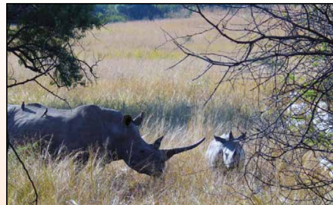
Rhinos in Pilanesburg Nature Reserve