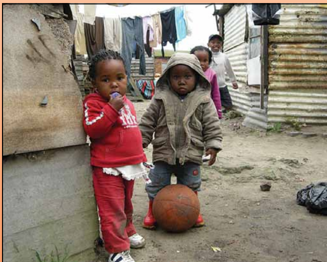
Children of the Gugulethu township near Cape Town

Although apartheid is officially a thing of the past, one still finds typical 'white' and typical 'black' towns in South Africa. Even though the political system changed back in 1994, cultural and economic changes simply take longer and the effects of forced separate development can still be witnessed in South Africa. This leaves South Africa with townships like Khayelitsha, Gugulethu, Soweto, Kwa Thema, Langa, Masiphumelele and Thembalethu. All have their own unique rhythm, where people smile and laugh despite their hardships. Where the ingenuity of the human mind is portrayed in entrepreneurs making something of nothing. Where singing is as natural a part of life as happiness, love, grief or death. Where singing with Africans for Africans will bring a tear to your eye and give you goose bumps. It is here where your dollars can make a significant difference to the lives of those not as fortunate as you are. Come experience South Africa's townships and they will leave a lasting effect on you larger than you can imagine.