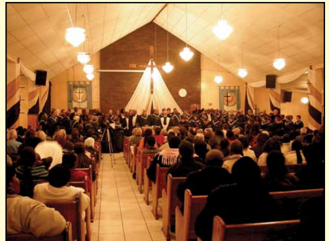
Bryn Mawr Presbyterian Church Choir performs with the Chamber Choir of South Africa in the Kwa Thema Methodist Church