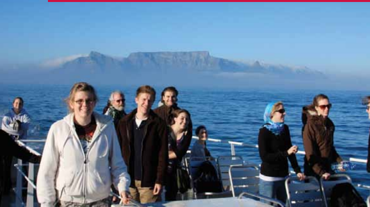
Northern Arizona University Shrine of the Ages Choir and the Master Chorale of Flagstaff on a boat to Robben Island with Table Mountain in the background

For over 55 years, ACFEA has been arranging concert tours to the best known and most prestigious cultural centers in Europe, and our enthusiasm for these destinations has never waned. However, in recent years our network of offices and representatives has expanded greatly, and we can now offer you the ACFEA experience in many less traditional places on every continent. Now is the time to consider South Africa as your next destination.